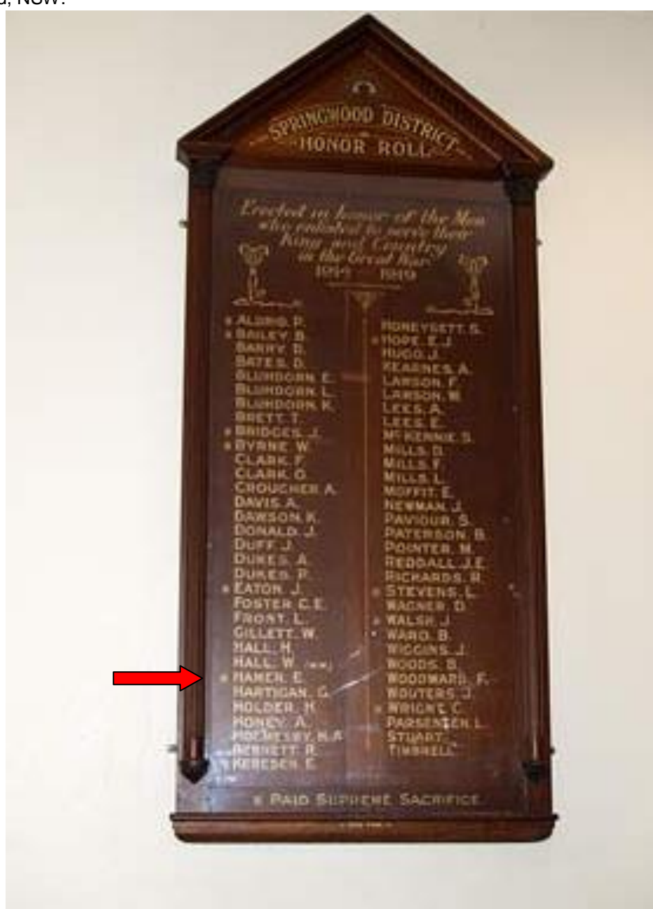
Springwood District Honor Roll