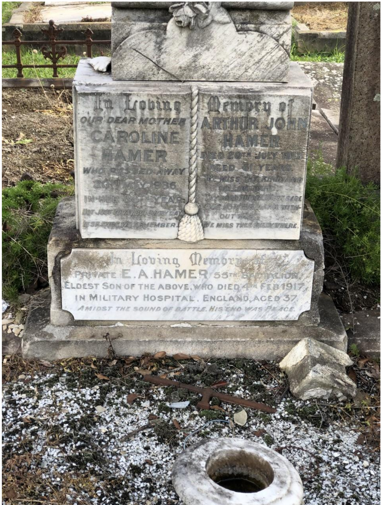
Hamer Headstone in Rookwood Cemetery